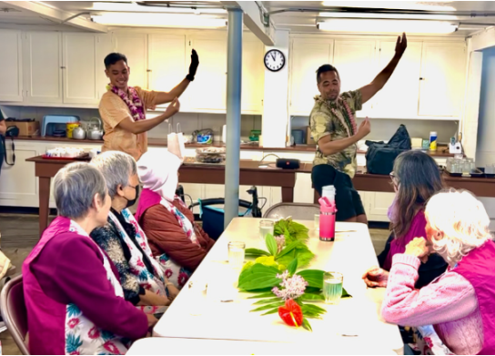
Apr: Senior Lunch Hula Surprise