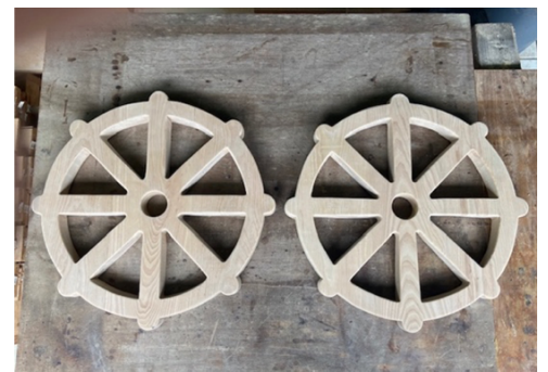
Dec: New Dharma Wheels