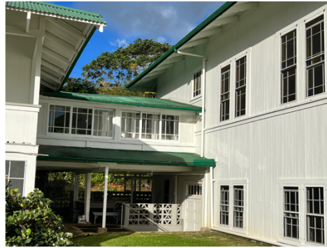
Feb: Breezeway DONE!