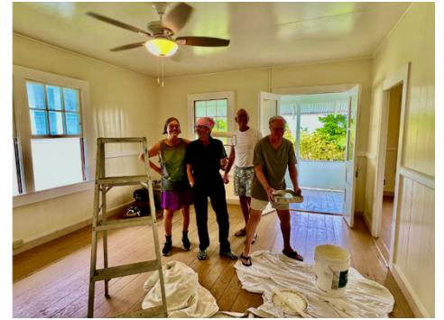
Mar: Parsonage Teamwork