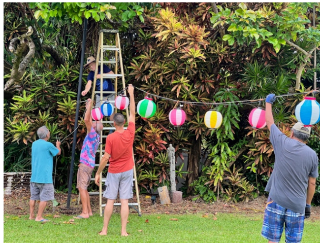
Aug: O-bon Set-Up