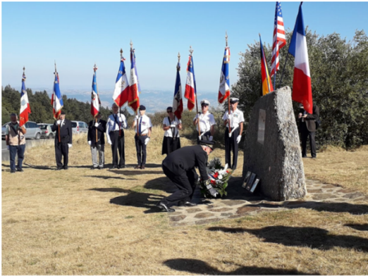
Laying a wreath to honor those who died in the crash.

better understanding of the human dimension of this tragedy, the deadliest air disaster ever to have occurred on Mont Pilat.