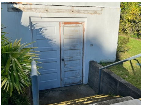
Oct: Ready to Paint!