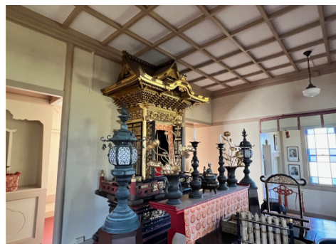
Nov: "New" Altar Brocade