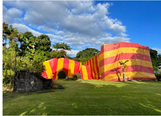
May: No More Termites!