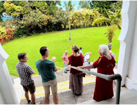
Jan: New Year's Fireworks