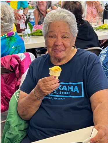
Jul: Ice Cream!