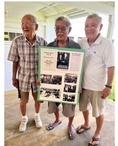
Sep: Friends Remember